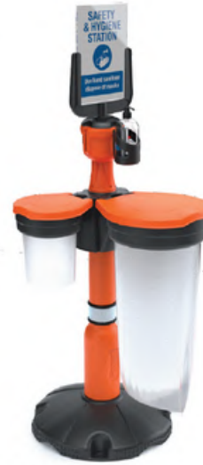
Safety station 3