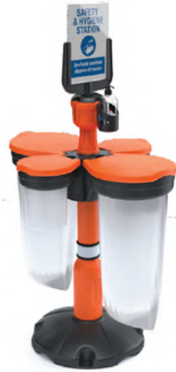
Safety station 2