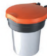
Skipper safety dispenser PRODUCT CODE: DISP01