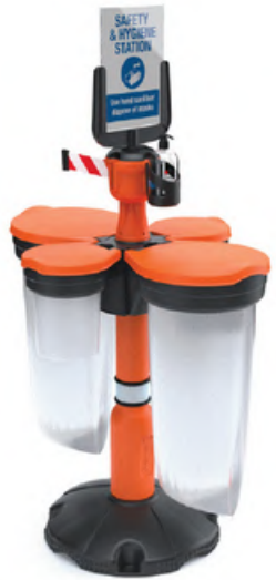
Safety station 1