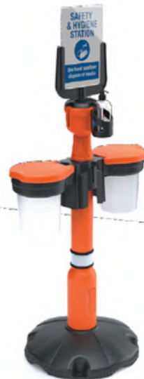
Safety station 5