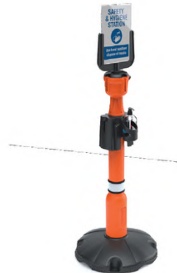
Safety station 6