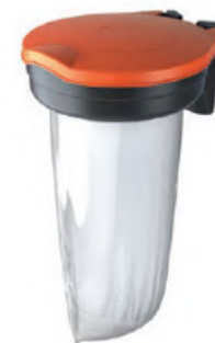
Skipper recycle bin PRODUCT CODE: BIN01.