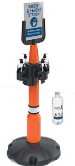
Safety station 7