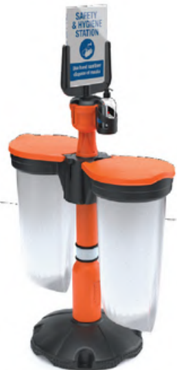
Safety station 4